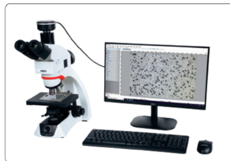
digital camera (supplied with software) and computer are optional