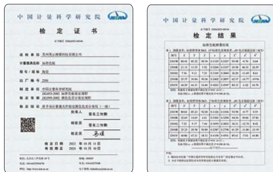
calibration certificate (included)