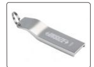
software flash disk (included)