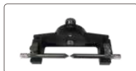
swivel center support