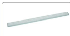
300mm/11.81" calibration scale (check magnification accuracy together with 50mm reading scale or calibrate measuring accuracy)