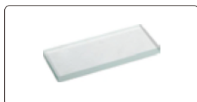
50mm/1.97" reading scale (check magnification accuracy)