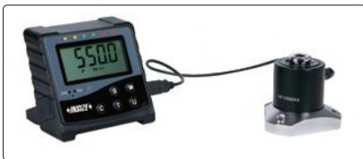
digital torque tester (optional)