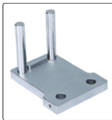
support plate (optional) suitable for short wrenches