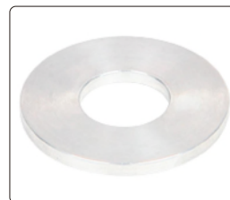
metal pad (included)