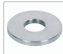
weight (2.5N) (included)