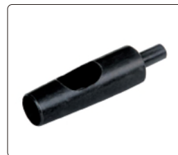
sample cutter (included)