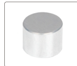
grinding block (included)